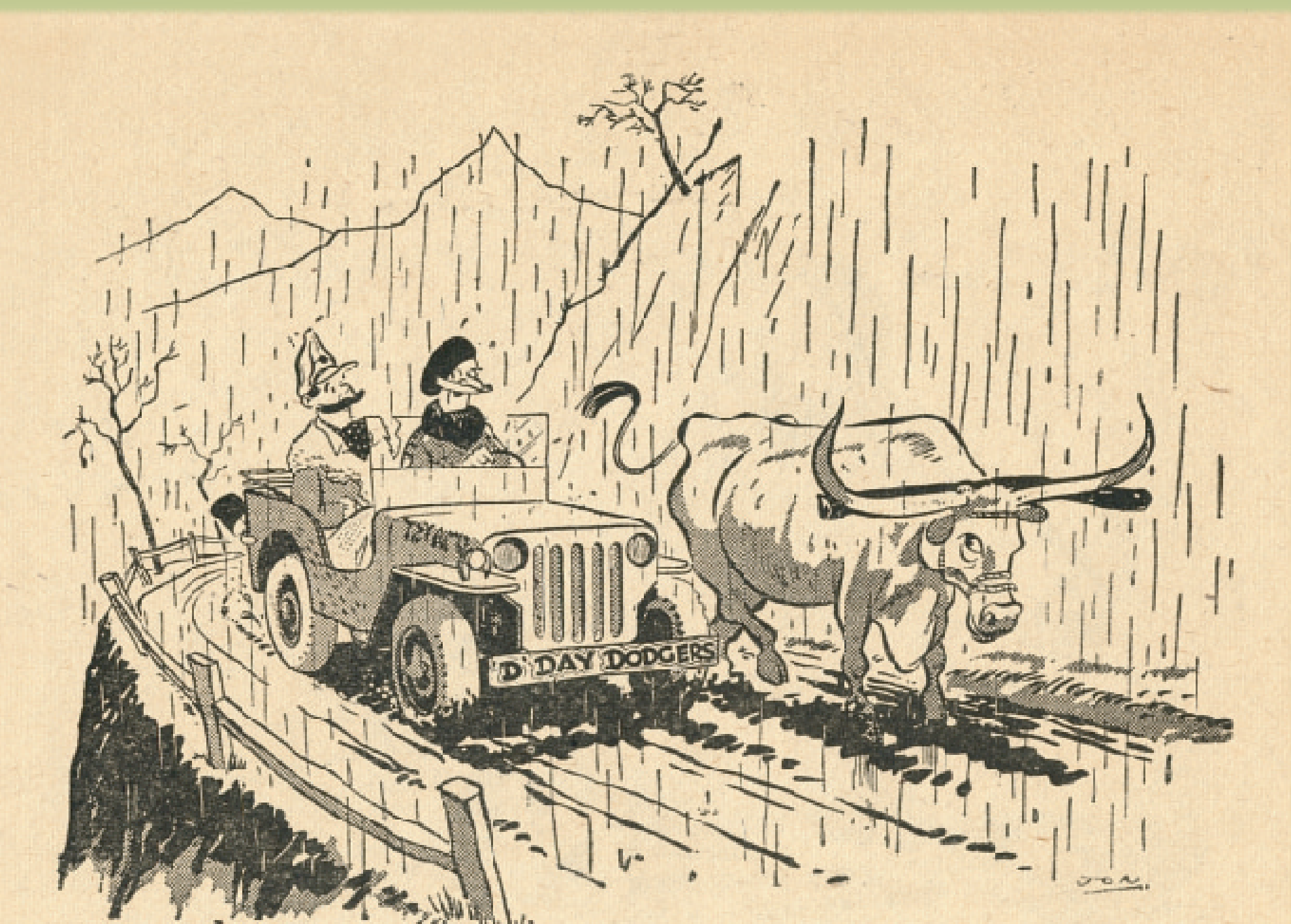
"Shall we give him a lift? Remember how useful he was last week"