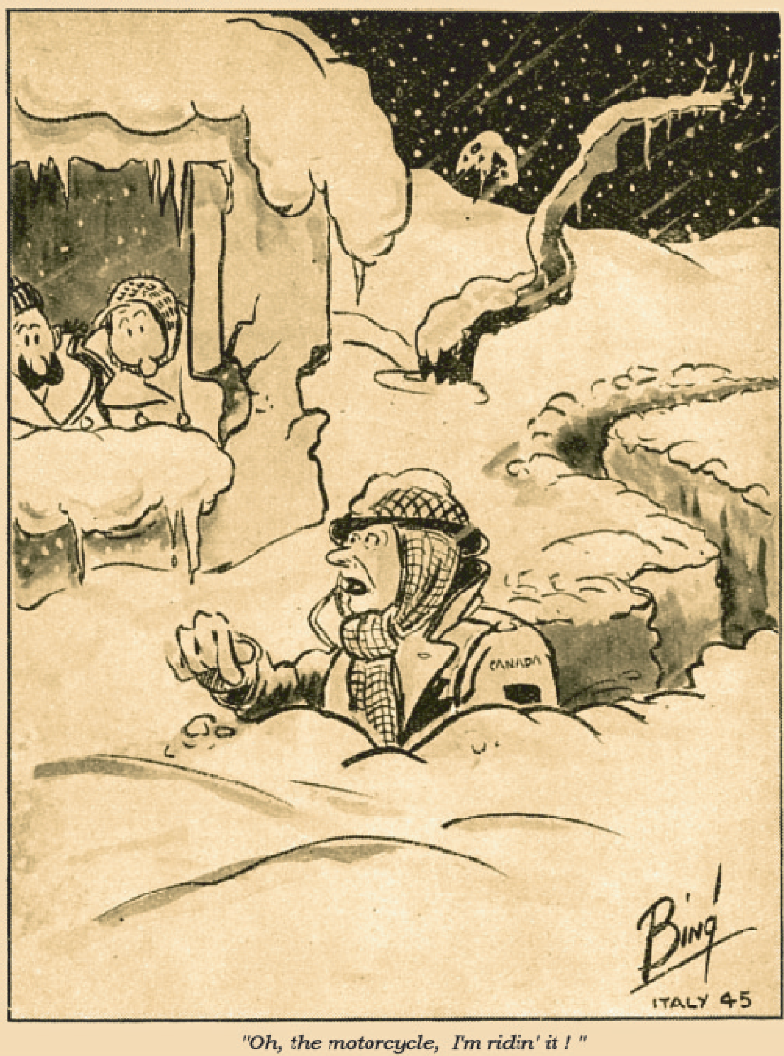
"Oh, the motorcycle, I'm ridin' it!"