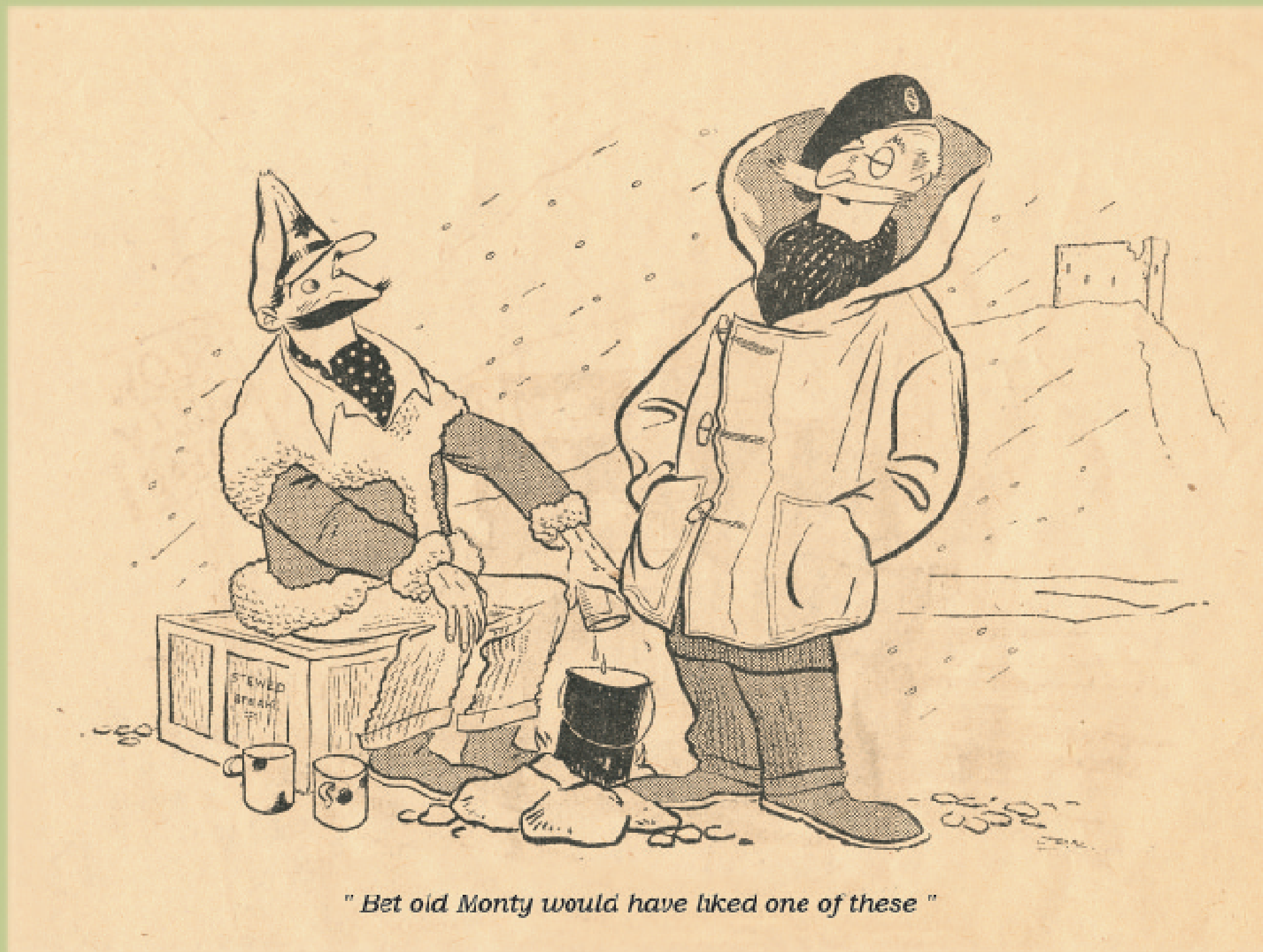
"Bet old Monty would have liked one of these"

5th Army Quiet. There was no report to-day of action by British and Polish units of the 5th Army, which were yesterday reported capturing Fievo di Casata, five miles northeast of Faenza, and patrolling across the Senio river, respectively. Only patrol activity was reported to-day from the Allied 5th Army front in central Italy.