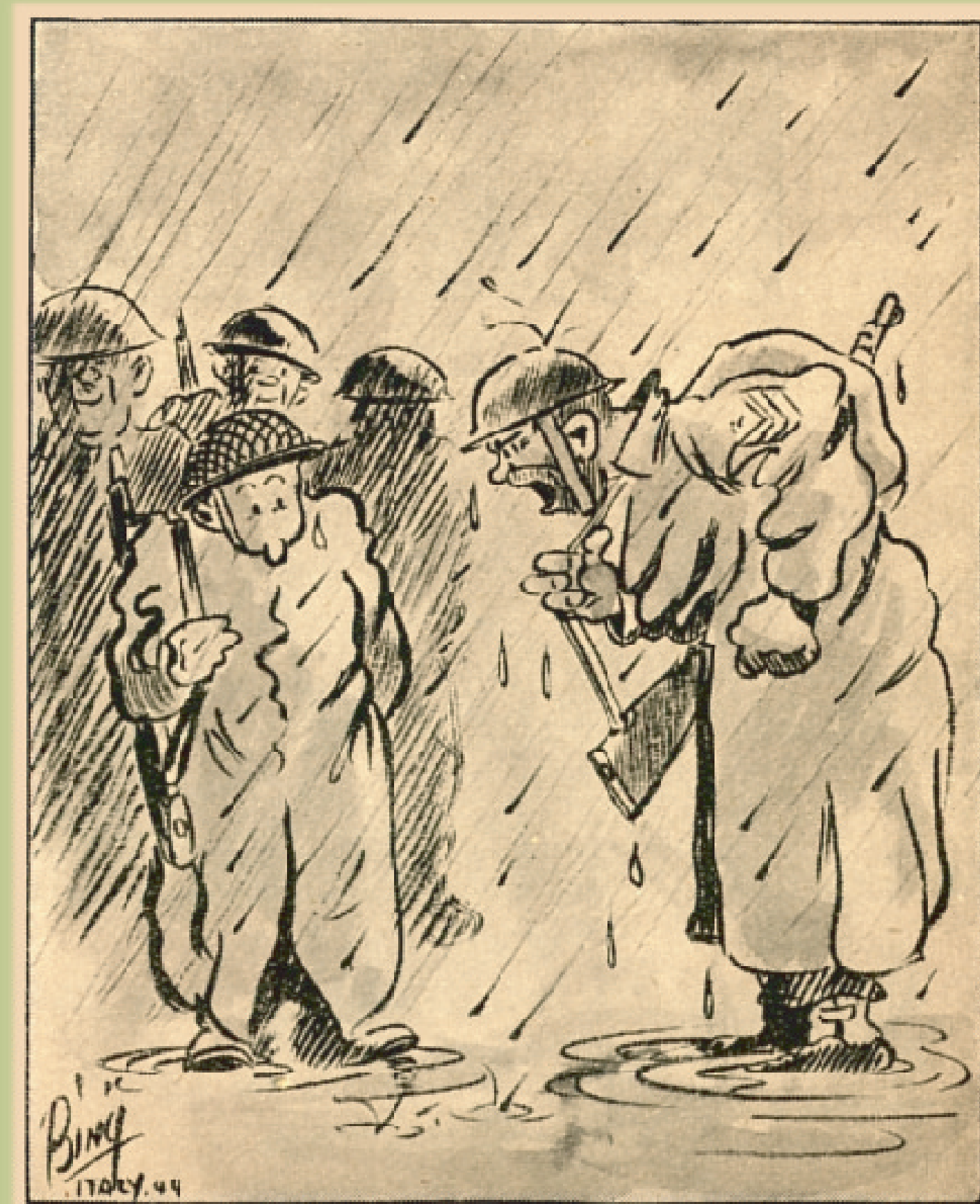
"For the last time, CUT OUT this 'Quack, quack' stuff!"